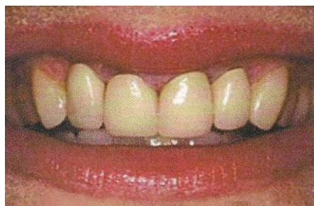
Metal can mean dark lines